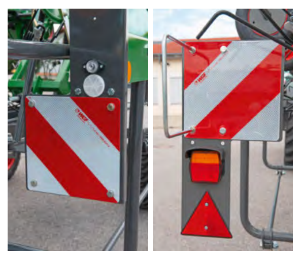
For increased road safety, attached Lotus models have extra-large warning signs and follow the main lighting actions as standard.

The maintenance-free double-cross joints ensure direct power transfer and means the tedder can turn even in the folded transport position.