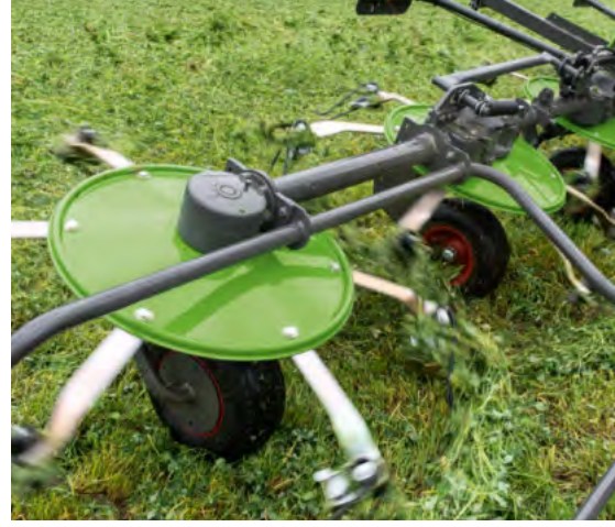
Voluminous tyres on every rotor for excellent feed intake and ground adjustment.