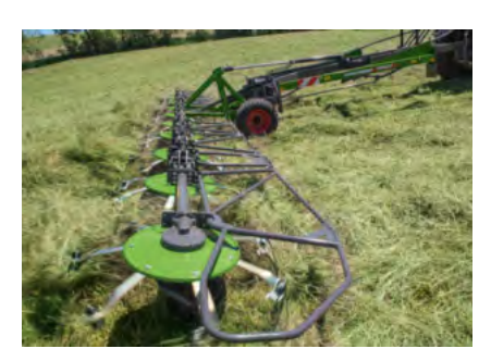
The large, forward-running transport wheels make sure it runs very quietly with a consistent working depth.