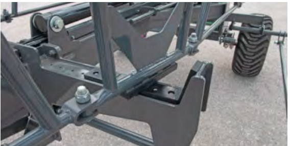
For road transport, the rotors are placed on the frame. This protects the pivot joints, as there is no stress on them at all when they are folded in. The special transport position, with the rotors lined up in a row, means that even the larger Lotus models are compact enough for transport.