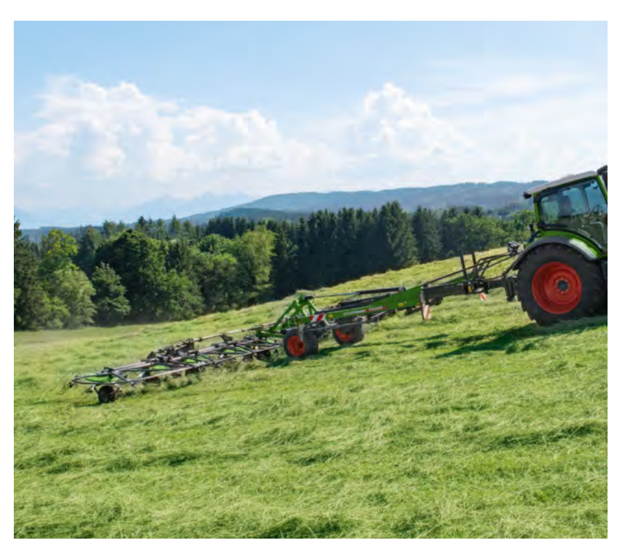
Spread over the working width, there are several swivel joints between the rotors that make sure each one individually adapts to the ground. Low wear and clean feed, guaranteed.