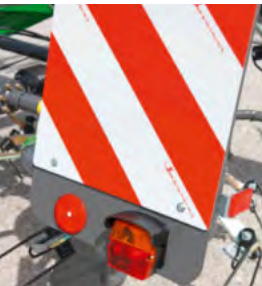
For maximum road safety, the Lotus 770 follows the main lighting actions, as an optional extra.