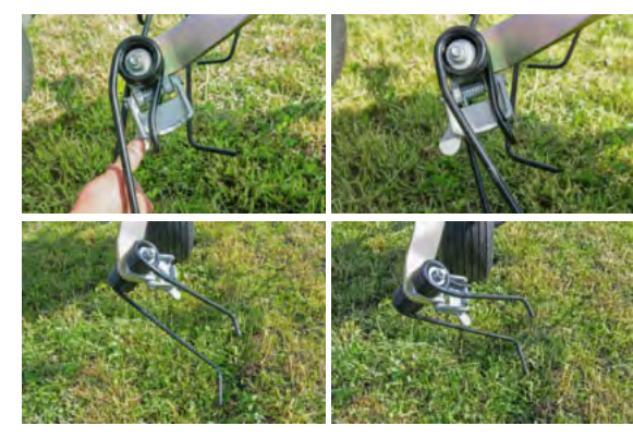
A simple adjustment of the tines on the outer rotor activates the edgeprocessing mechanism. This puts the tines in the innermost position for a neat field edge and to perfectly distribute the mowed crop.