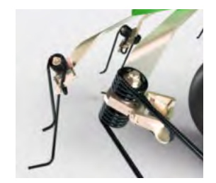
Because the wheel is close to the tines, the machine adapts beautifully to the ground, every