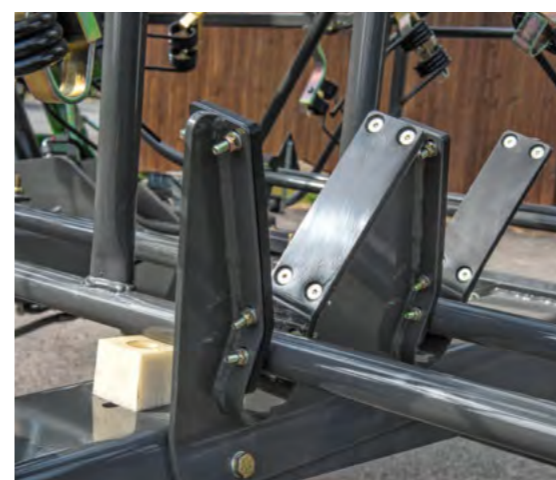
■ The Twister hoop guards, which are equipped with long-life bearings, fit perfectly into the special v-shaped brackets on the frame. (Only on Fendt Twister chassis version.)