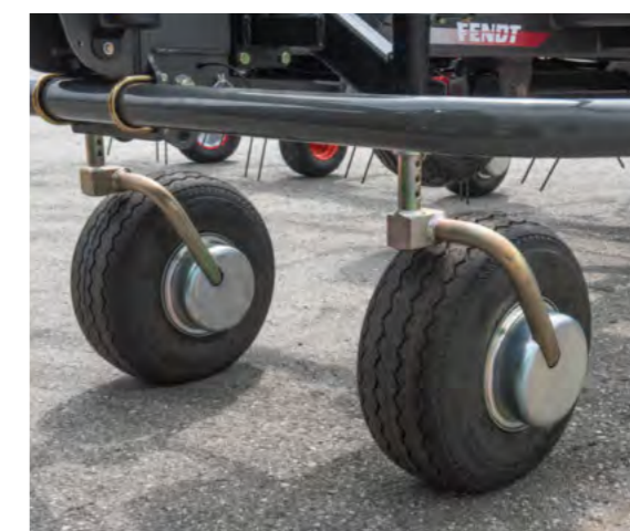
□ The optional mobile feeler wheels optimise the ground tracking, and ensure clean raking and sward protection. (Fendt Twister 901 T)